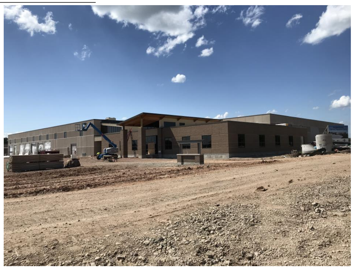
View from the Southeast Corner