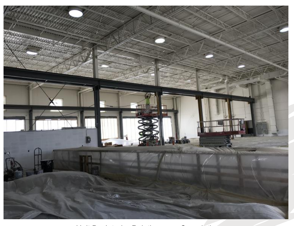
Unit B—Interior Painting near Completion