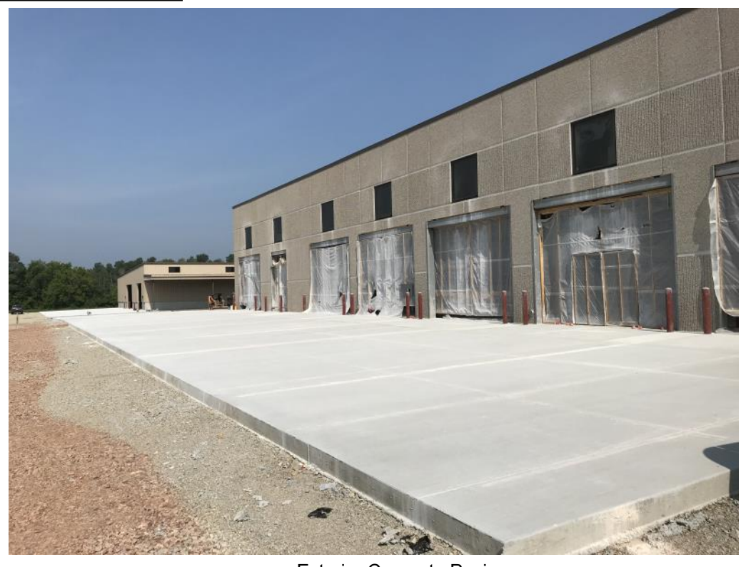
Exterior Concrete Paving