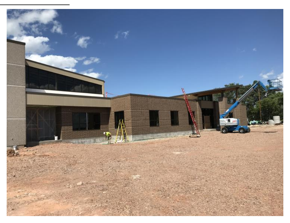
View from the Staff Entrance