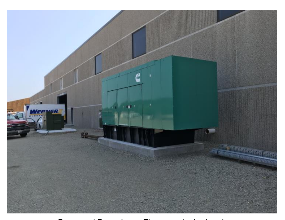
Permanent Power is on. The generator is placed.